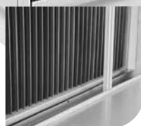
❻ Condensate pan