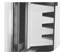
⑩ Compressible filter track