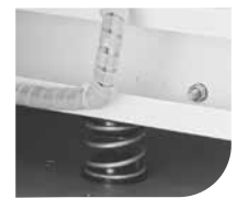
⑯ Anti-vibration mount