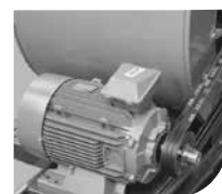
❼ Adjustable motor support bracket