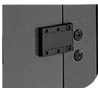
❺ Composite hinge