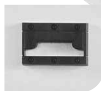
❹ Opening handle